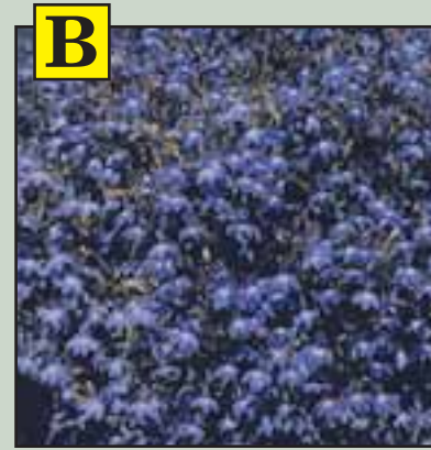
B Lobelia Blue Lobelia produces thousands of brilliant blue flowers on low-growing 4"-6" plants. Perfect for rock gardens, borders and pots.